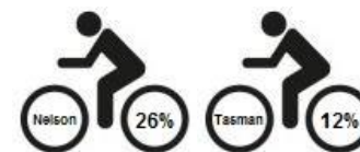
Increase of people cycling to work from 2006 - 13